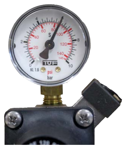
The CO<sub>2</sub> regulator set to a pressure of 6 bar