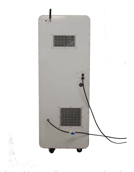
Rear view with water line, power cord, and antenna