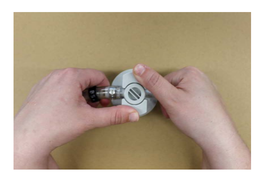
Proper holding technique for a QDC