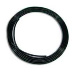
3/8" Polyethylene Tubing