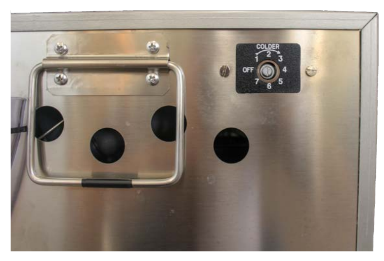
Carbonator thermostat set to 6