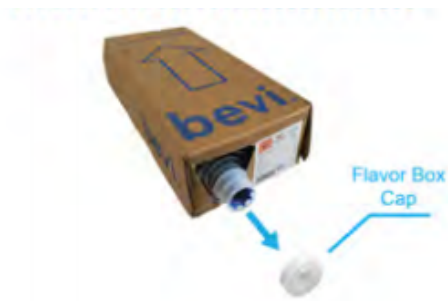
Old Flavor Box