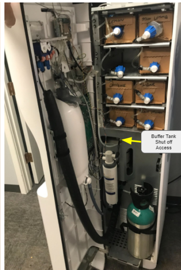
Buffer Tank Valve Access