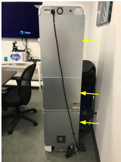
Back Panel Edges

All of the Bevi Standup 2.0 chassis and hardware have been milled to avoid sharp edges, however when handling components or accessing certain areas of the Bevi that have any edge could cause a scrape or even a cut. The following areas should be noted so that extra care and precautions can be taken to avoid a problem